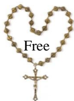
Rosaries in Narthex

† - In honor of deceased ♥ - Anniversary/Marriage ♫ - Birthday/Thanksgiving SI - Special Intentions